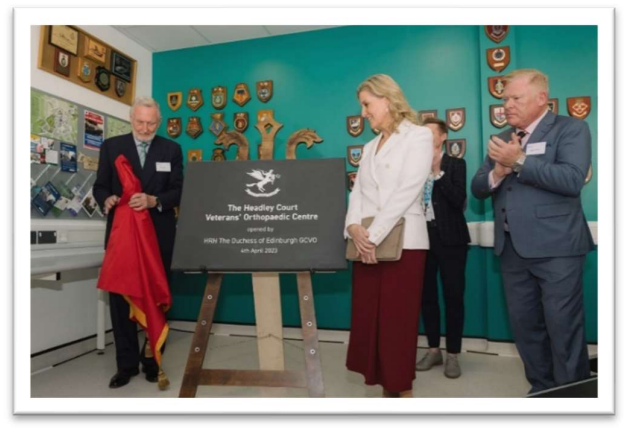
Official opening of the Headley Court Veterans' Centre

• £29,000 was spent on the Veterans' Orthopaedic Centre, £12,000 on a Stakeholder Review, £10,000 on the official opening which included a royal visit, £6,000 on designs for the next phase of the centre, and £1,000 on soft furnishings for the Hub and quiet rooms.