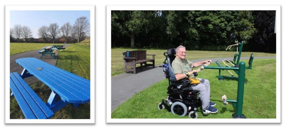
Marmax bench and outdoor gym equipment