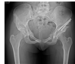
B. After PAO left hip