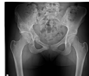
A. Before PAO left hip