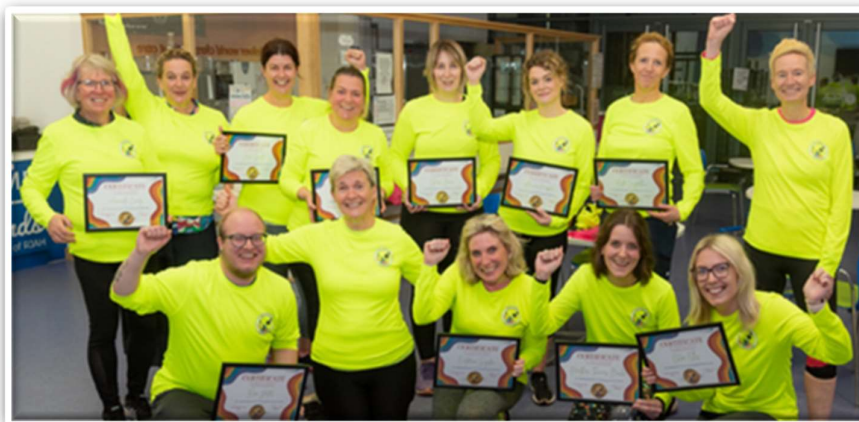
A team of RJAH staff successfully completed the NHS Couch to 5k programme

The group – dubbed the RJAH Rockets! – launched back in September 2022 and spent nine weeks completing the programme and celebrated their graduation by taking on Oswestry's parkrun – a 5k route at Henley Wood.