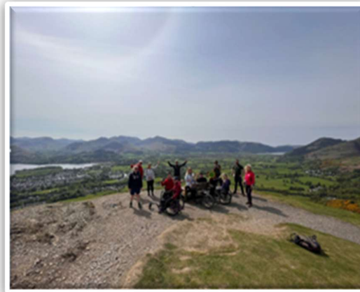
Calvert Trust Activity week 5 patients 4 staff 1 volunteer being adventurous