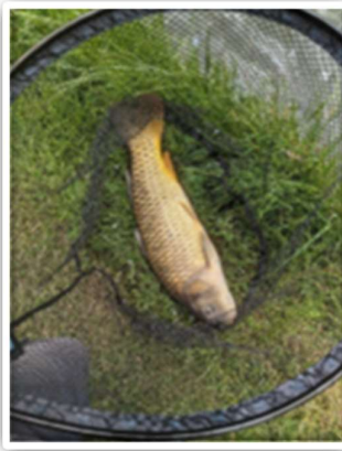
Fishing outing - lots of fish caught!