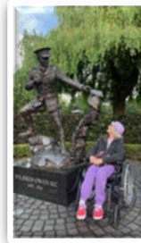
Coffee, shopping, book and park visit