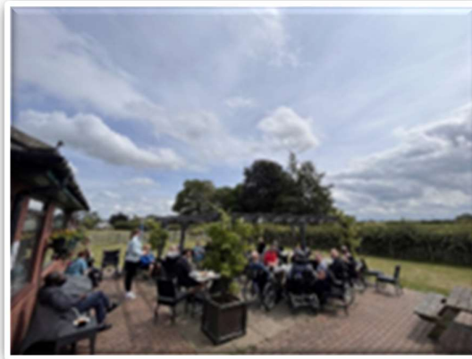
13 Patients on a trip in July to Derwen College for coffee and cake