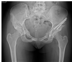
B. After PAO left hip