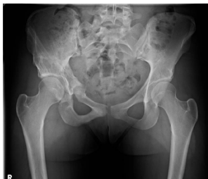
A. Before PAO left hip